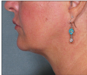
After (actual patient)

Dr. Timothy Jochen is a specialist in liposuction and has performed thousands of tumescent liposuction procedures. For liposuction of the chin/neck, he makes a tiny incision under the lower jaw to insert a very small canula of less than 1.5 mm in diameter to then suction out the fat. Some swelling and bruising is normal following the procedure and he says most patients return to work in about five days. For the first few weeks after surgery, patients are asked