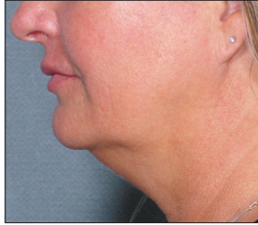
Before (actual patient)

For some patients, however, it's not age, but rather an inherited tendency to retain fat in the chin area. For these people, liposuction offers an excellent solution to create more definition between the chin and neck.