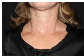
After (4 weeks - 1 treatment)

face, neck and chest, as well as performs these treatments, one of the major benefits of this laser over other vascular lasers is that it does not typically produce the purpura (purple bruising) immediately following a treatment which can last up to 10 days. This