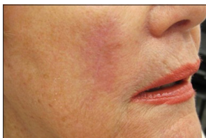
Treated with dermabrasion and V-beam laser.