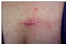
Hypertrophic chest scar treated with V-beam laser.

When healing is overaggressive and an abundance of collagen is produced these itchy, painful, very often oversized and unsightly scars are the result. A combination of treatments is usually required and run the gamut from steroid injections to lasers, compression dressings made of silicone that flatten, to a freezing technique known as cryotherapy, among others.