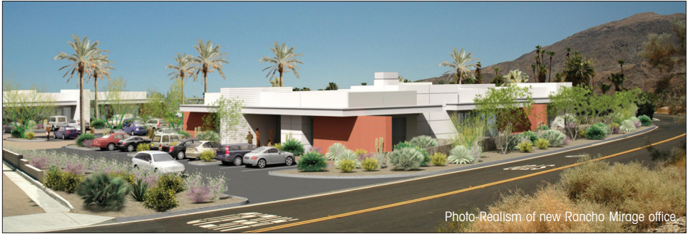
Photo-Realism of new Rancho Mirage office.

In order to enhance patient comfort and convenience, Contour Dermatology & Cosmetic Surgery Center is expanding, with new offices being built in Rancho Mirage, and a new office now open for business in Santa Monica.