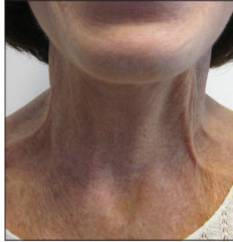
Treatment of neck bands with Botox.

The size and extent of platysmal neck bands is the determining factor on how best to treat them.