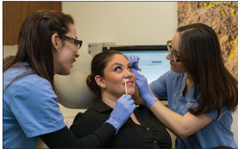
Having a little fun for the camera!