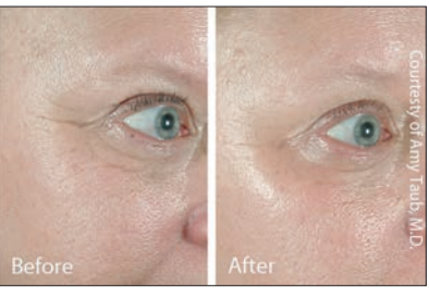
Note significant reduction of Crow's Feet.

world, but there is an alternative resurfacing method capable of delivering similar results. Sublative Rejuvenation™ uses fractionated bi-polar radio frequency technology to direct heat energy underneath the skin. That's right — no laser, no light, but still an effective way to address any skin imperfections troubling you.