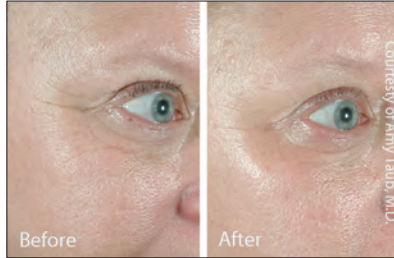
Note significant reduction of Crow's Feet.

Lasers grab a lot of attention in today's skin care world, but there is an alternative resurfacing method capable of delivering similar results. Sublative Rejuvenation™ uses fractionated bi-polar radio frequency technology to direct heat energy underneath the skin. That's right – no laser, no light, but still an effective way to address any skin imperfections troubling you.