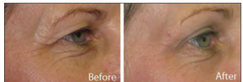
Note tightening of skin on upper eyelids.

Do you feel bad about your neck? Sublative radiofrequency treatments are an excellent way to firm up sagging skin and rejuvenate the entire neckline. If you're not yet ready for a necklift, try the Sublative method of stimulating collagen and elastin production deep in the dermis. It's a good defense